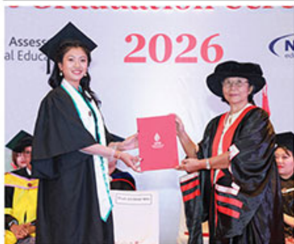
From Page - 2